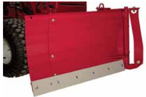
6" Straight Edge Ext