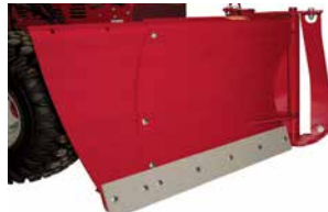
6" Ext with 6" Top Flare