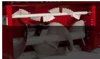
Deep Snow Kit